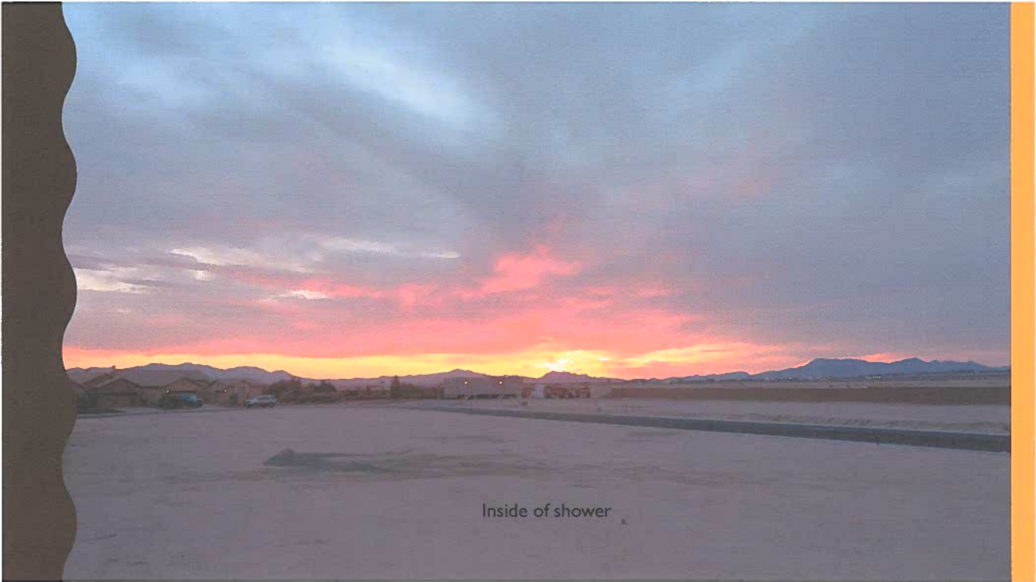
Inside of shower