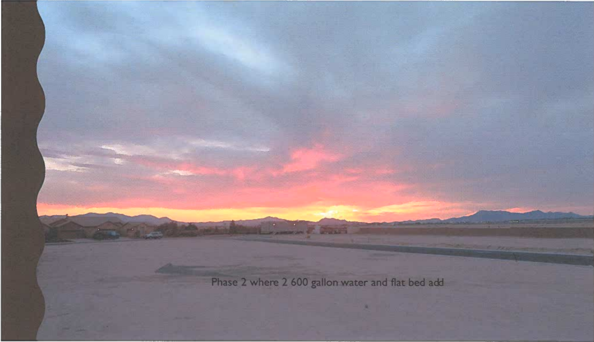
Phase 2 where 2 600 gallon water and flat bed add