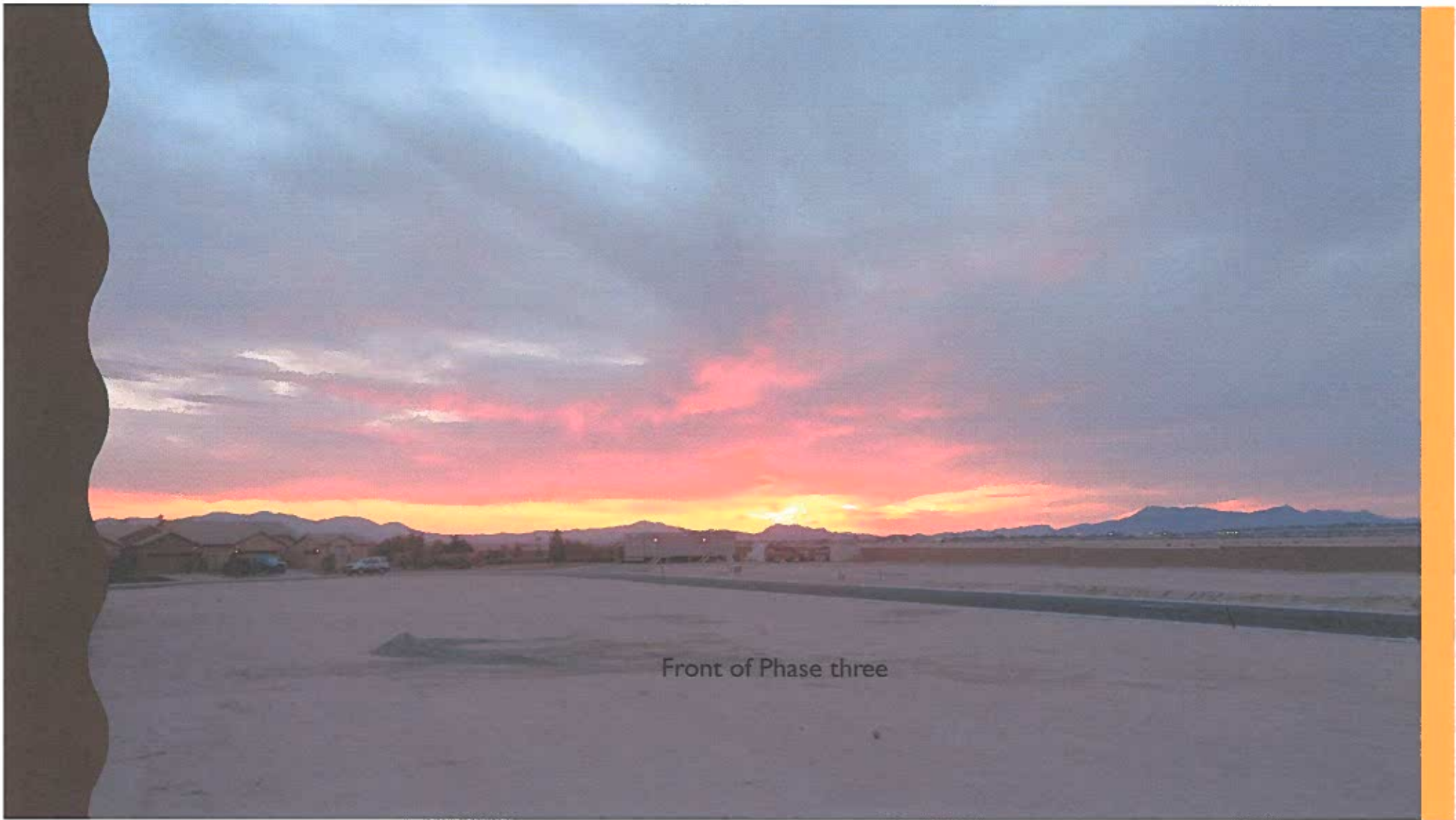
Front of Phase three